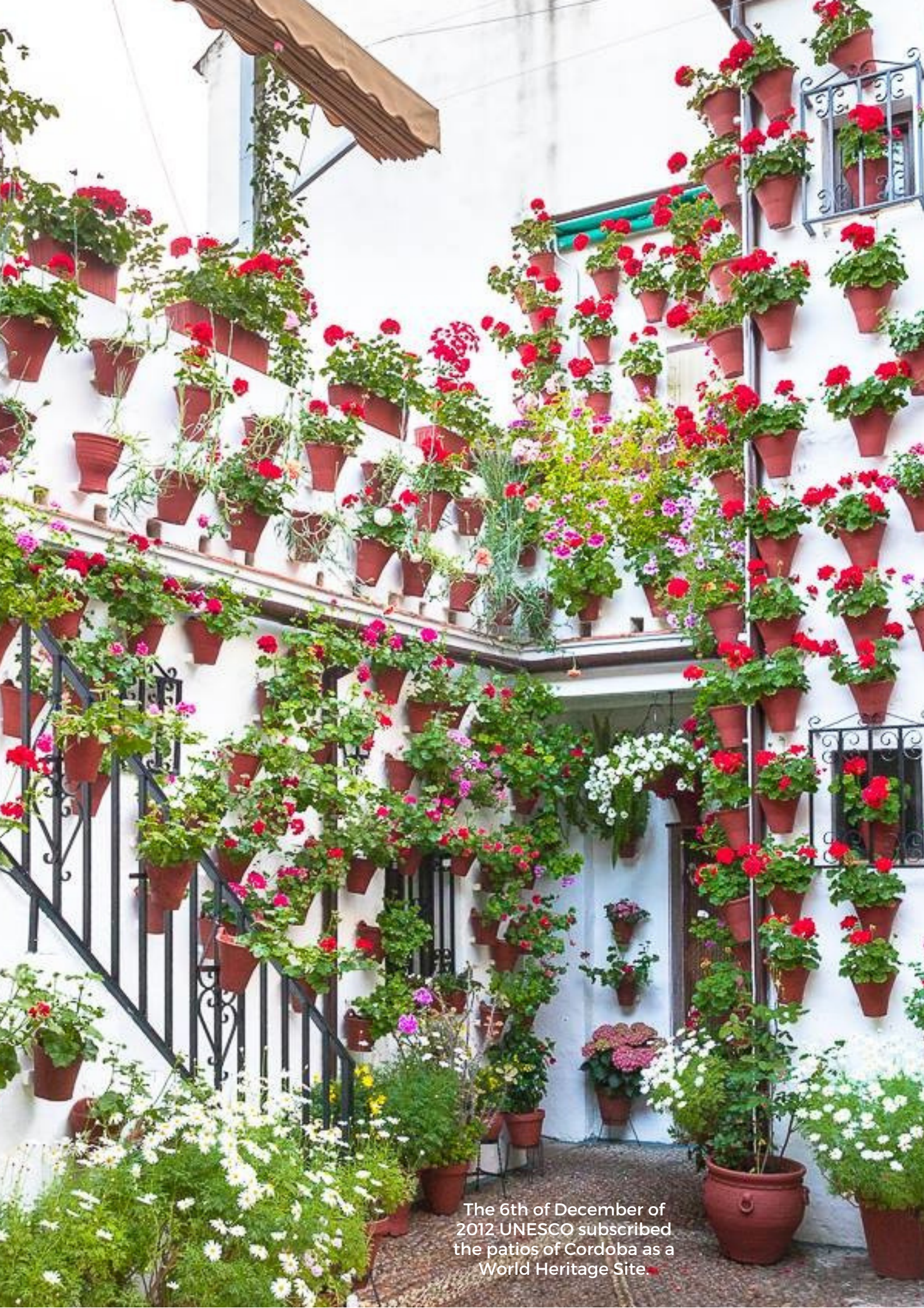
The 6th of December of 2012 UNESCO subscribed the patios of Cordoba as a World Heritage Site.