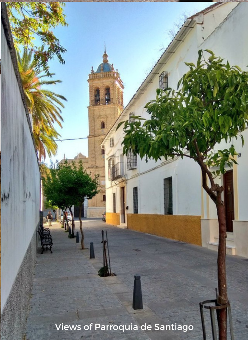
Views of Parroquia de Santiago