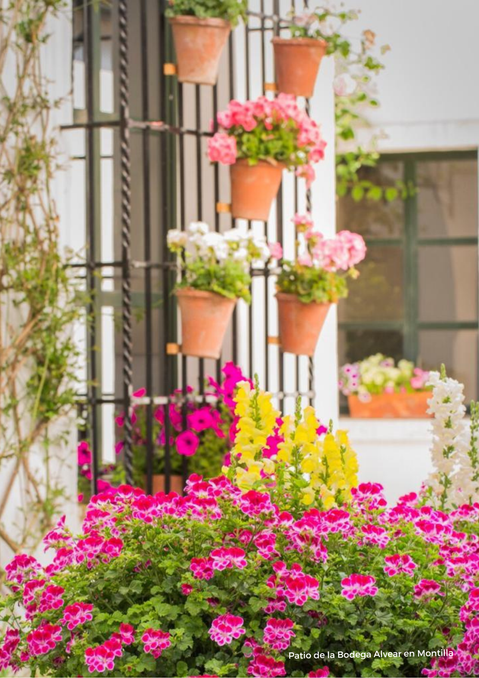
Patio de la Bodega Alvear en Montilla