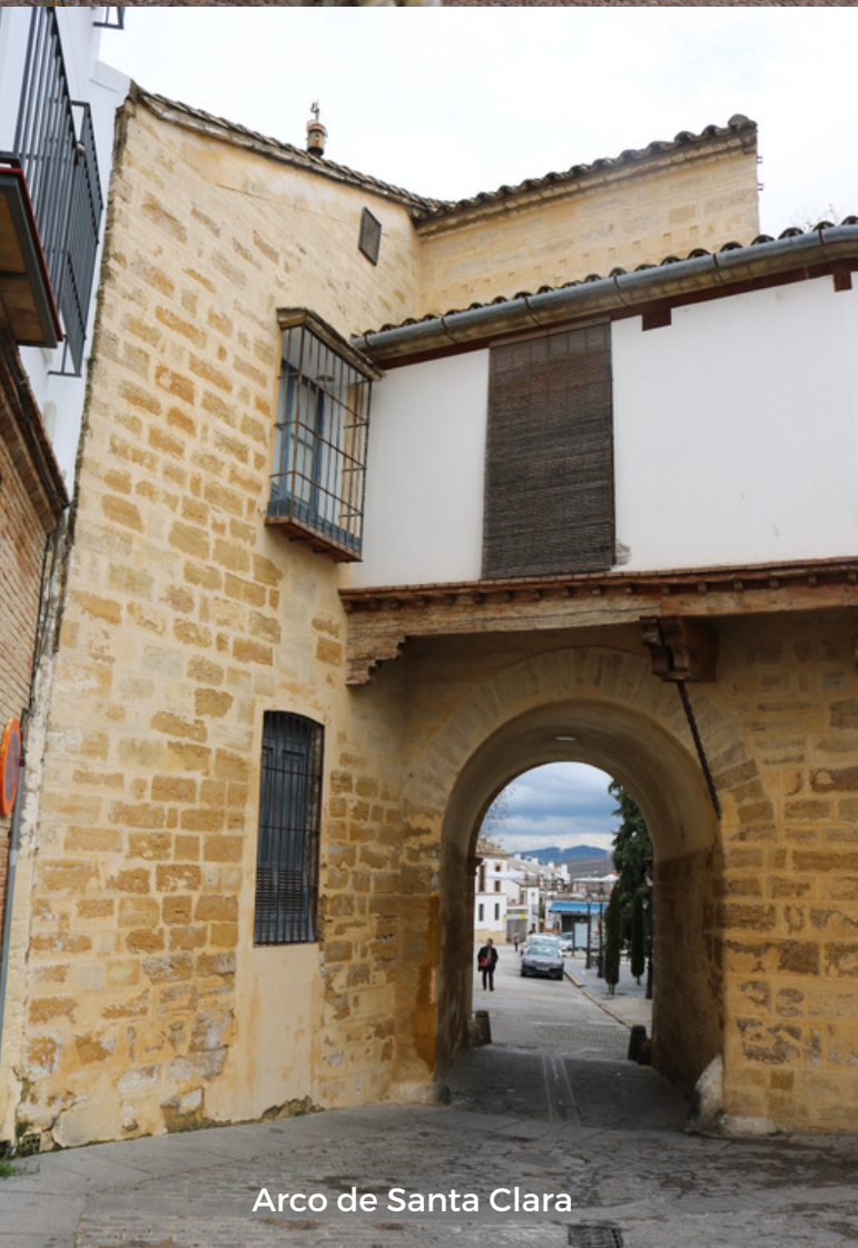
Arco de Santa Clara