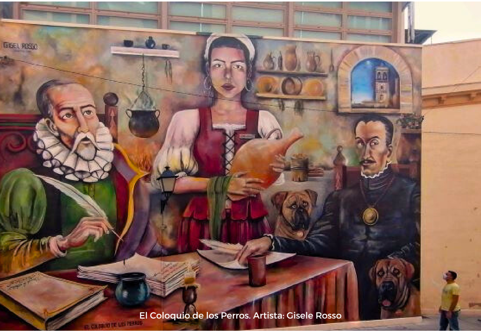
El Coloquio de los Perros. Artista: Gisele Rosso