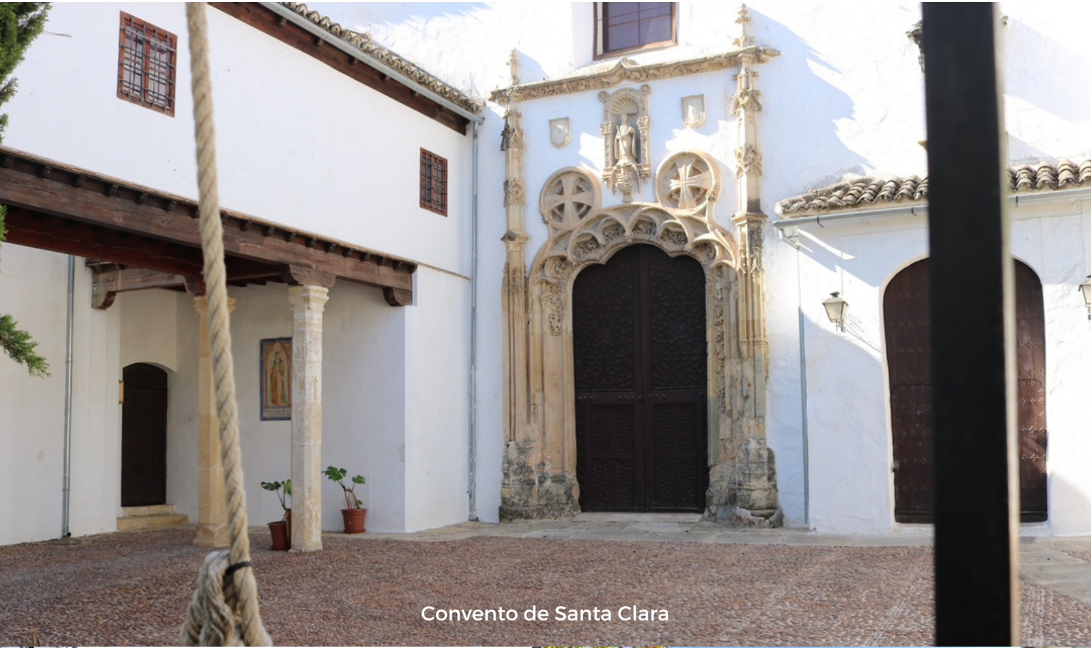
Convento de Santa Clara