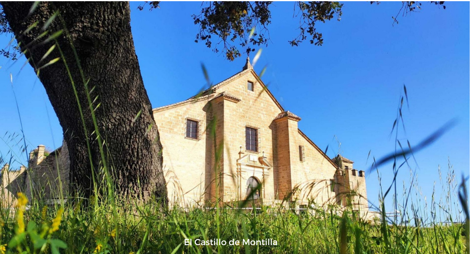
El Castillo de Montilla